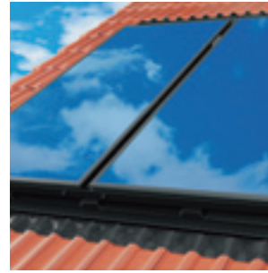
The Schüco Solar Thermal System

Thermal solutions that come with all of the parts to turn your home into an energy producer.